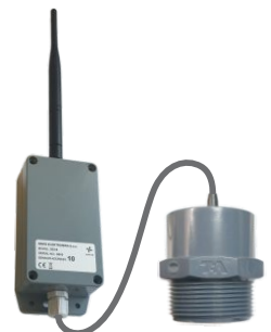
SU12 - 2" ULTRASONIC LEVEL SENSOR