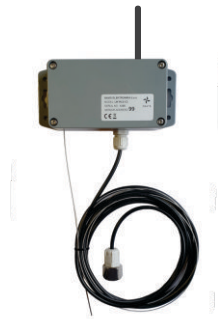
SC10 - CAPACITIVE LEVEL SENSOR