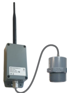
SU11 - 6/4" ULTRASONIC LEVEL SENSOR