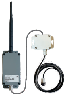
SC10/R - CAPACITIVE LEVEL SENSOR